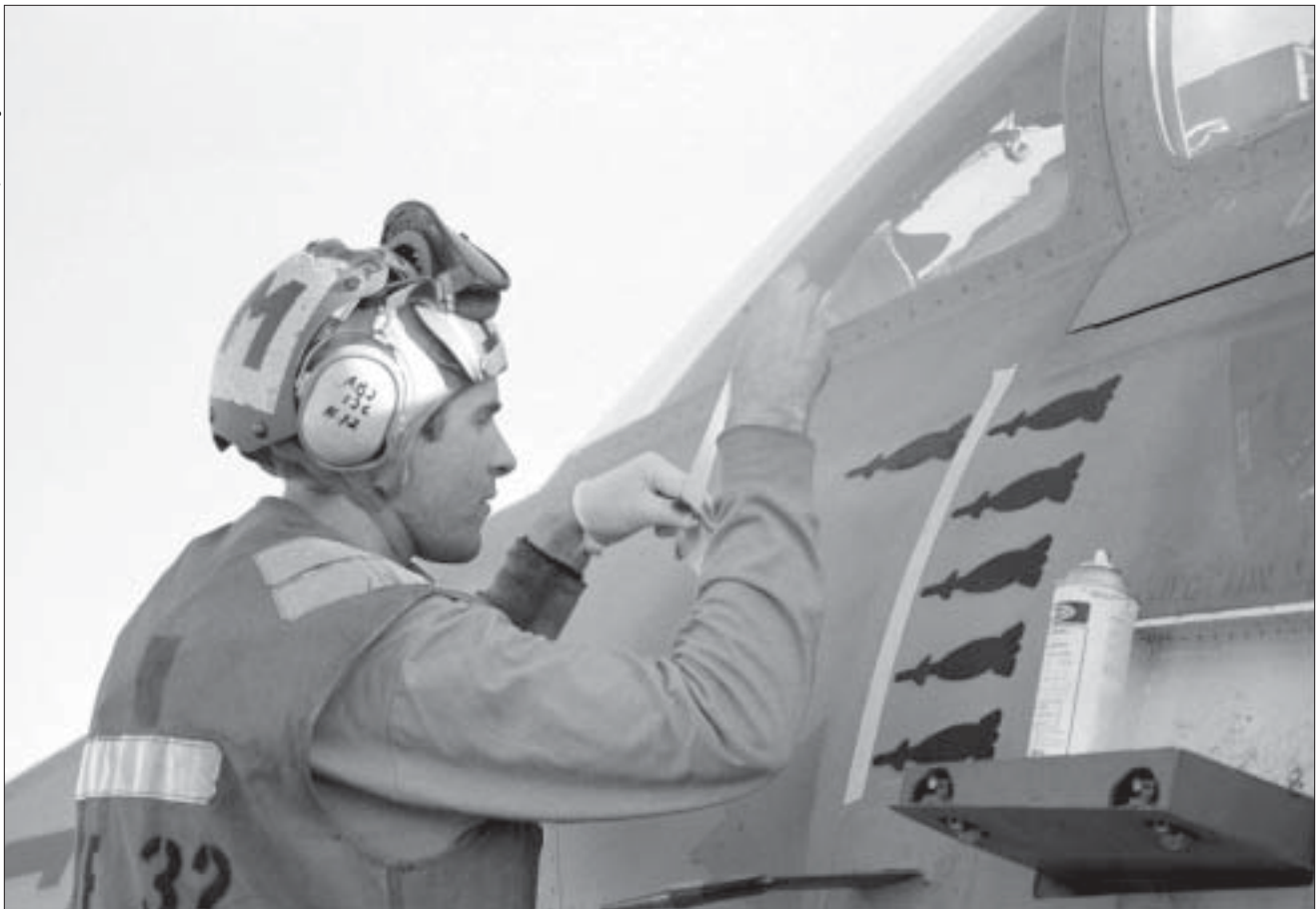
US serviceman paints bombs to symbolize each of the warplane's bombing runs during Operation Desert Fox, December 1998.