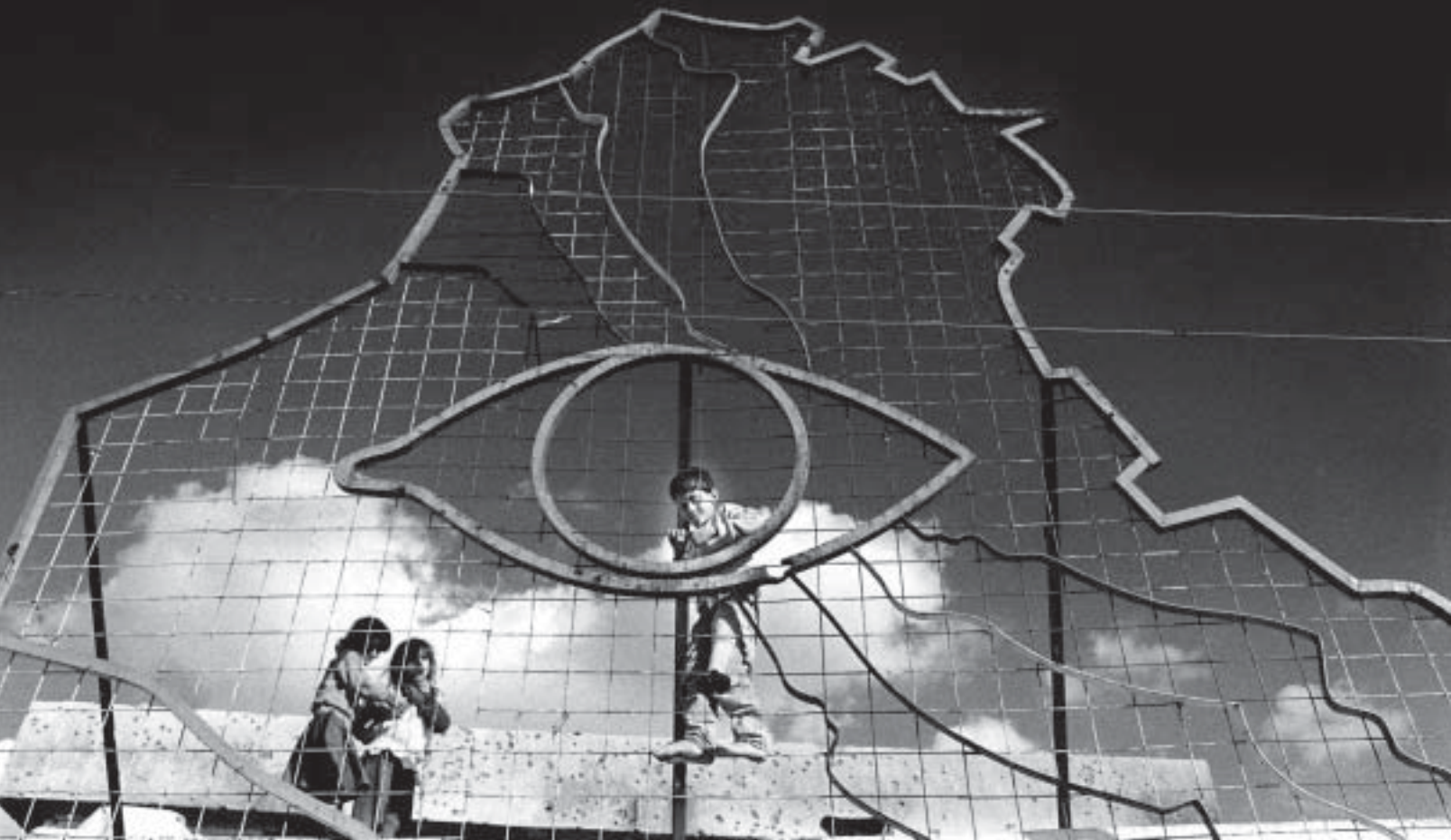
Kurdish children climb on sculpture atop former Iraqi intelligence headquarters in Suleimaniya in northern Iraq.