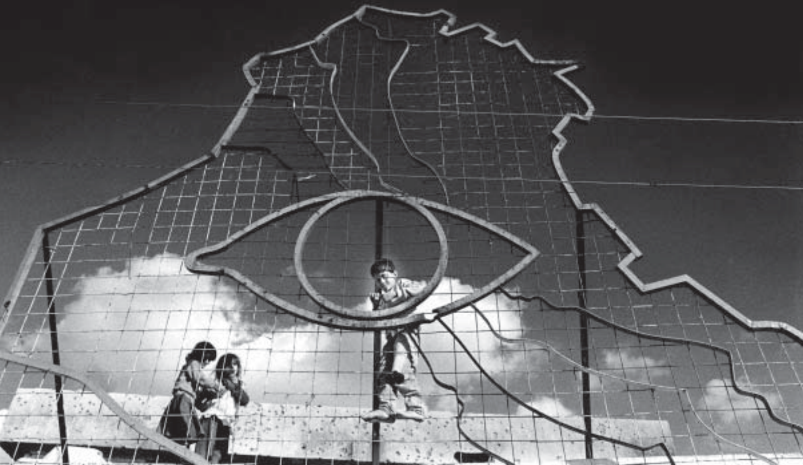
Kurdish children climb on sculpture atop former Iraqi intelligence headquarters in Suleimaniyya in northern Iraq.