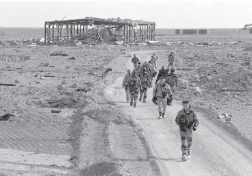
H. Arvidsson/United Nations

To bolster the urgency of its case, the British dossier added the contention – based on unnamed